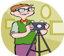
Photo Contest - Tuckerton Seaport 120 West Main Street - P.O. Box 52 Tuckerton, NJ 08087