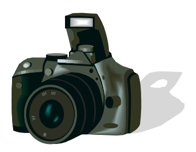
Organized for the mutual advancement and enjoyment of photography in New Jersey.