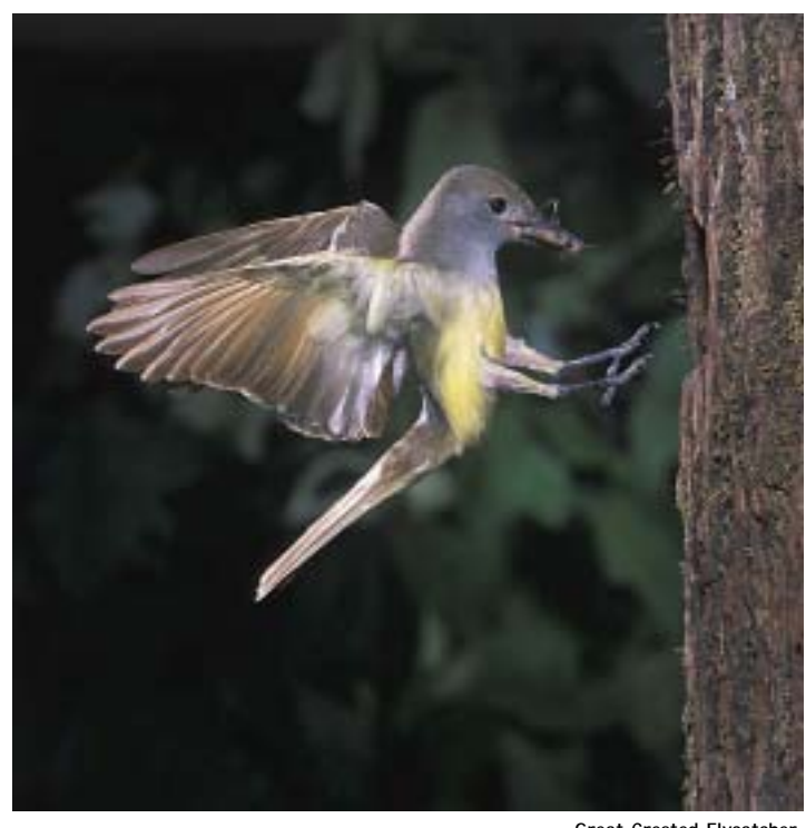
Great Crested Flycatcher Phil Echo