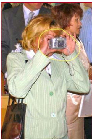
Today's Blonde Photographer

Unfortunately, there's no such thing. Take advice from your friends, take sample shots at the camera store, and read the reviews. What can I say? Life is rarely black-and-white; it's far more often filled with shades of gray.