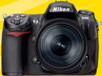
Photo Camera of the YEAR 2007