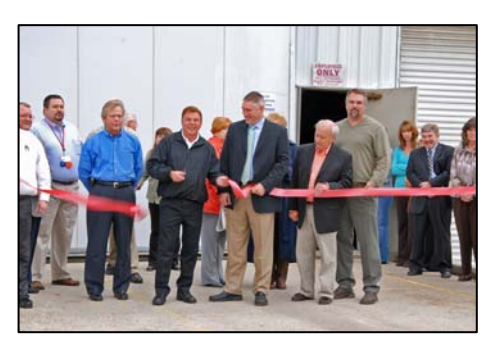
The opening of a new warehouse, CAP's third, in Tennessee, to support annual distribution of more than $100 million of donated goods to 1,800 other charities throughout Appalachia.

I have been photographing their activities and working with the local press to generate publicity for their many endeavors. Soon we plan to pursue more national media.