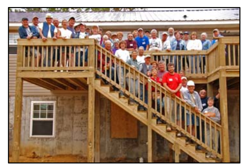
The construction of a new home, in six days, by 43 members of the Fox Valley Mission Group from Wisconsin for a Kentucky family with three disabled family members.

The rewards come from knowing I am helping some truly needy people and from meeting and working with some of the finest people I have ever met. Some of the activities I have covered include: