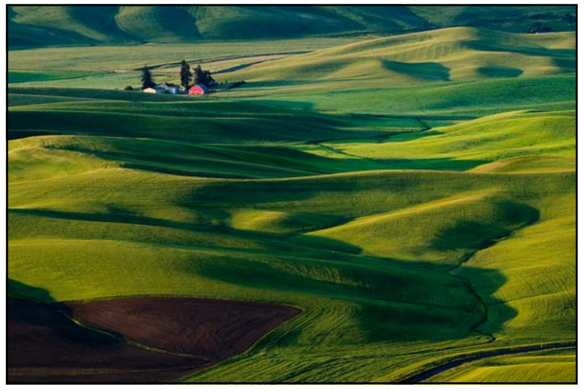
Red Barn in Wheat Fiekls