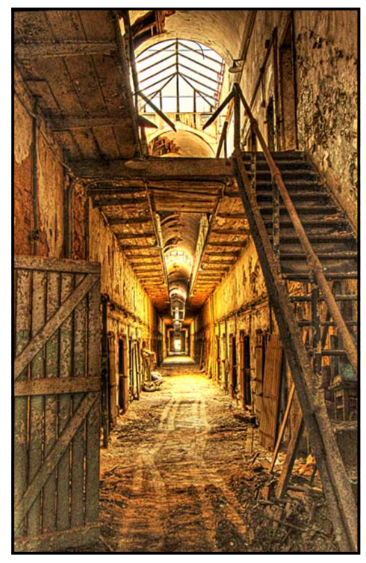
Light at the End Vicki DeVico