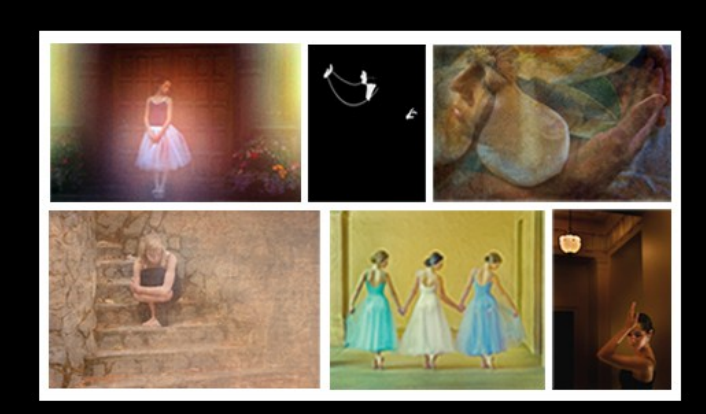
learn more at www.marsschool.com