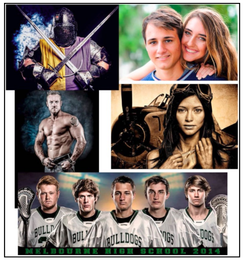
A Selection of the Type of Work Done by Vanelli

As usual, Photorama featured lots of coffee and a luncheon for those who chose not to venture to a local restaurant. Unique Photo jumped in as a last minute vendor. Door prizes were furnished by Vanelli, Hunt's Photo and the NJFCC.